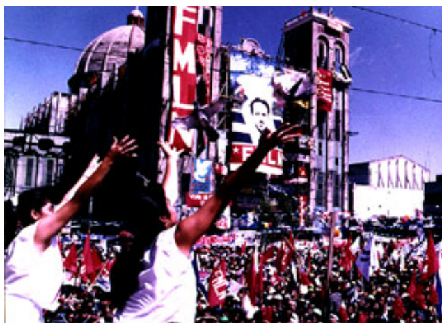
Celebration of the Peace Accords—January 16, 1989

Monday, June 1, 2009 at 6PM Center for Latin American Studies Conference Room -Kelly Hall 117 5848 S. University Ave